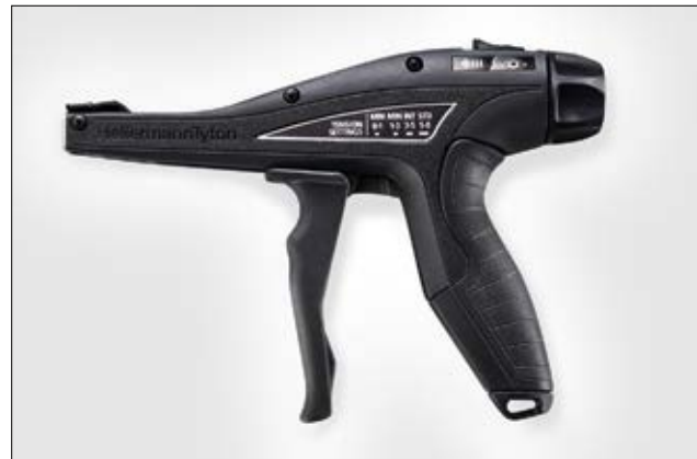
The EVO7: Maximum performance with minimum effort.