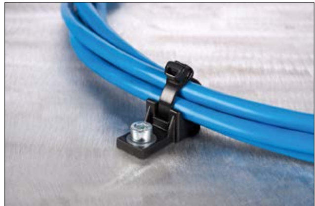
X-series provides a superior fixing solution for tight applications.