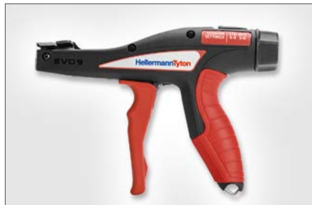
The EVO9 with TLC-Technology.