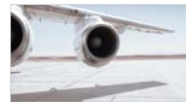
Aviation and aerospace