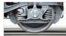
Rail vehicle construction