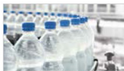
Food and beverage industry